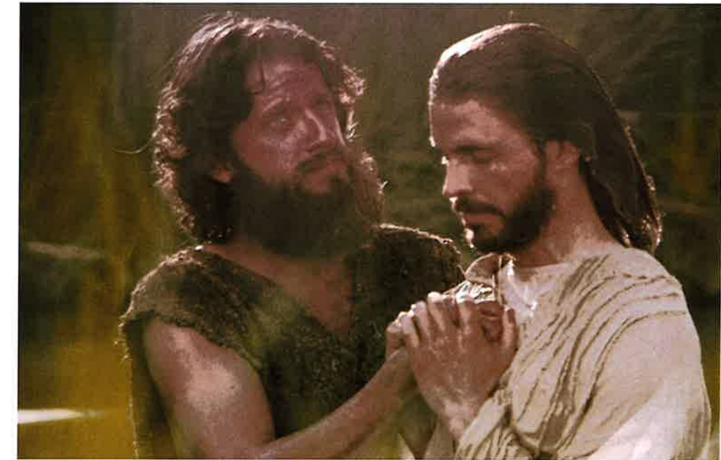
John would have prevented him, saying, "I need to be baptized by you, and do you come to me?"

Evangelism: We Come Together To Share the Good News of Jesus With Our Community and the World